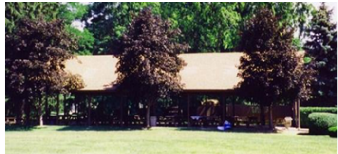
Walnut Grove Pavilion - Burgundy Basin Inn

This presentation will focus on the New Construction Program and available technical assistance and capital incentives.